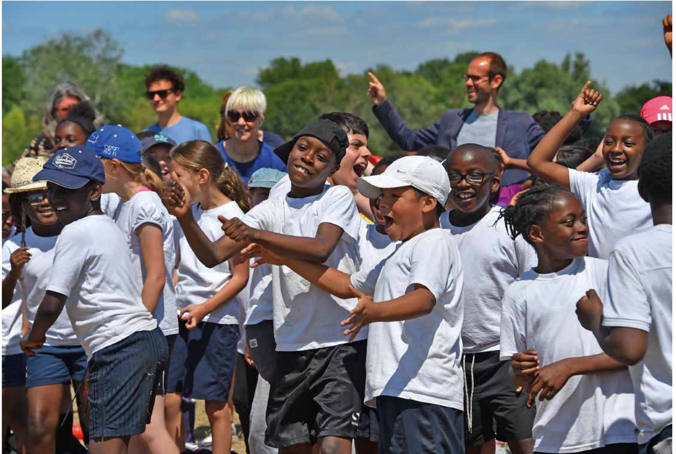
A Street Elite Festival in Southwark, celebrating with local schools