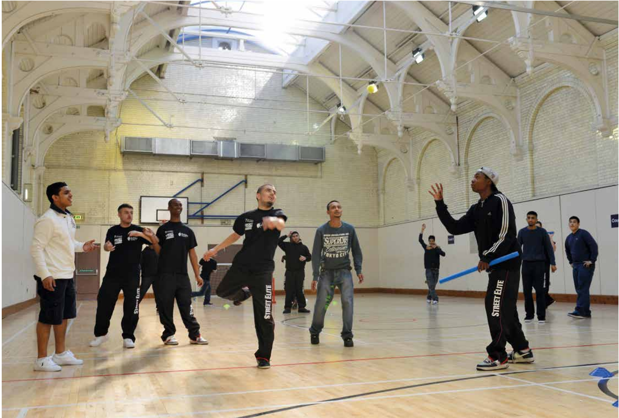
Early days: a training session to build trust and teamwork skills